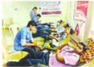
రక్తదానం చేస్తున్న విద్యార్థులు

అల్లంపల్లి మండలం పెద్దగొట్టెకుందవూరు. ఈ గ్రామం నంద్యాల జిల్లాకు చెందినది. గ్రామం నుండి 100 మీటర్ల దూరము, నల్లమల రహదారి నుండి 5 కి.మీ. దూరములో ఉన్నది. ఇది ఒక చిన్న గ్రామం. ఇది ఒక చిన్న గ్రామం.