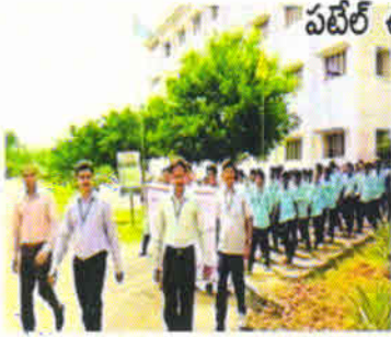
ర్యాలీ నిర్వహిస్తున్న విట్స్ విద్యార్థులు