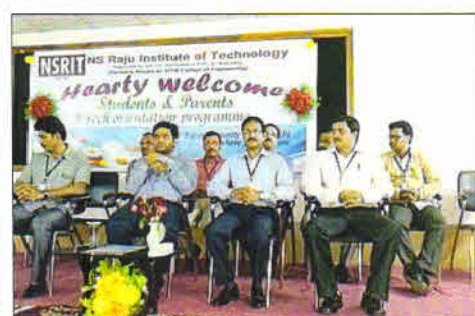
First year orientation Program conducted on 30-6-2016.