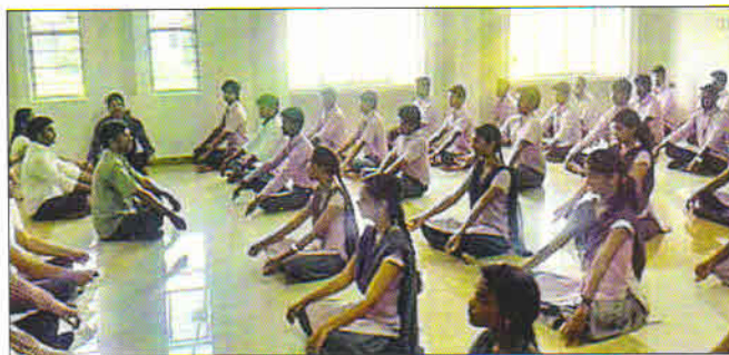
INTERNATIONAL YOGA DAY CELEBRATION ON 21ST OF JUNE