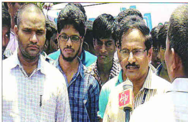
NSS TEAM Conducted A Blood Donation Camp In The Campus In Association With The As Raja Blood Bank On 24 Th Of September, 2016.

31.10.2016 : I B.Tech Students participated in Sardar Patel Birth Anniversary (National Unity Day) As such the institute NSRIT celebrated and observed this day and arranged a meet at 10.30AM which is held on 31-10- 2016 organized by NSS Unit.