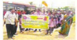
రాయలీ నిర్వహిస్తున్న విద్యార్థులు

ನೀತಿಬೋಧನೆ: ಪ್ರಾಚೀನ ಮಹಾಕಾವ್ಯವು ಪ್ರಾಚೀನ ಕಾವ್ಯವನ್ನು ಪ್ರೇರಣಿಸಿ ಕವಿಗಳು ಕವಿತೆಗಳನ್ನು ರಚಿಸಿದ್ದಾರೆ. ಇವುಗಳಲ್ಲಿ ಅತ್ಯಂತ ಪ್ರಮುಖವಾದವುಗಳೆಂದರೆ ಮಹಾಭಾರತ ಮತ್ತು ರಾಮಾಯಣ. ಈ ಕಾವ್ಯಗಳು ಕೇವಲ ಕಥೆಗಳನ್ನು ಹೇಳುವುದರಲ್ಲೇ ನಿಲ್ಲದೆ, ಜೀವನದ ವಿವಿಧ ಅಂಶಗಳನ್ನು ಪ್ರತಿಬಿಂಬಿಸುತ್ತವೆ. ಇವುಗಳಲ್ಲಿ ಅತ್ಯಂತ ಪ್ರಮುಖವಾದವುಗಳೆಂದರೆ ಮಹಾಭಾರತ ಮತ್ತು ರಾಮಾಯಣ. ಈ ಕಾವ್ಯಗಳು ಕೇವಲ ಕಥೆಗಳನ್ನು ಹೇಳುವುದರಲ್ಲೇ ನಿಲ್ಲದೆ, ಜೀವನದ ವಿವಿಧ ಅಂಶಗಳನ್ನು ಪ್ರತಿಬಿಂಬಿಸುತ್ತವೆ.