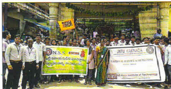
NSS Campaign on usage of clay vinayaka ideals and its benefits at Simhachalam.

NSRIT, Sontyam carried out Mass Tree plantation in its campus premises in association with EENADU -ETV Andhra Pradesh with the theme of "Vana Bharati-Jana Harati" the program was carried out in the rain drenched early morning of August 13, 2016