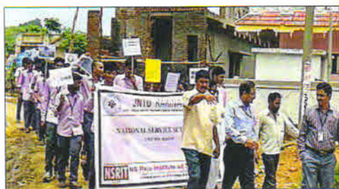
NATIONAL SER- VICE SCHEME (NSS) CAMP CON- DUCTED BY NSRIT IN MUCHHERLA VILLAGE ON 25TH JULY 2016