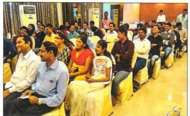
ALUMNI: Alumni Hyderabad Chapter Inauguration, Third Alumni meet Hyderabad.